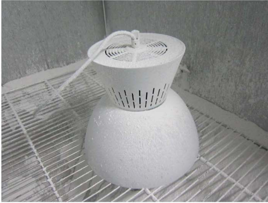
IP6X after the test