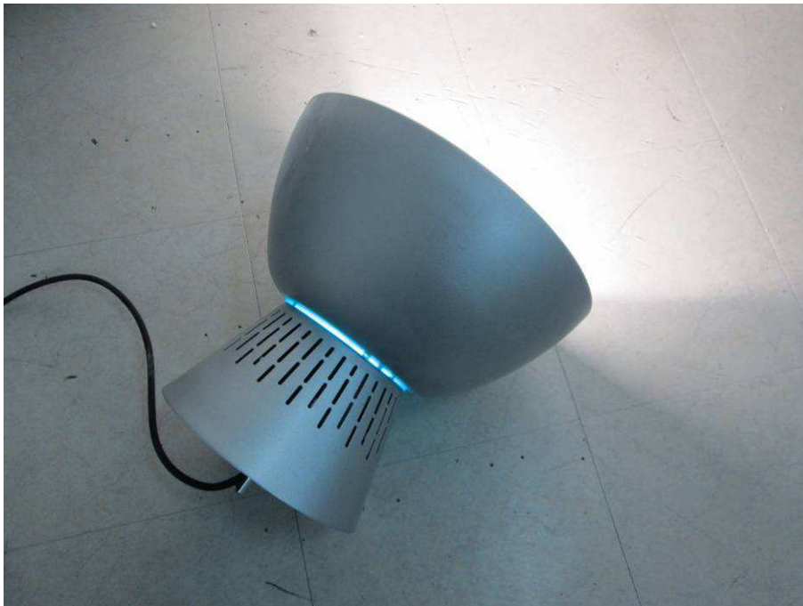
IPX5 after the test