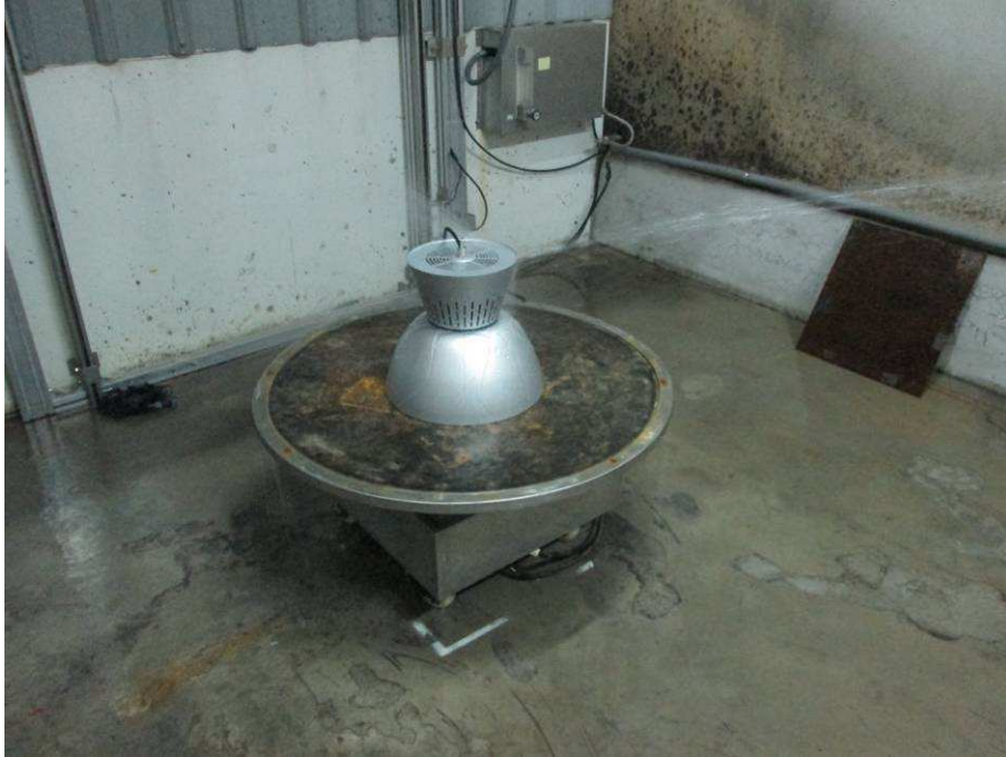
IPX5 after the test