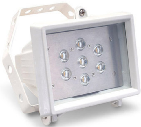
◆ ProLight 1W LED x 7 pcs