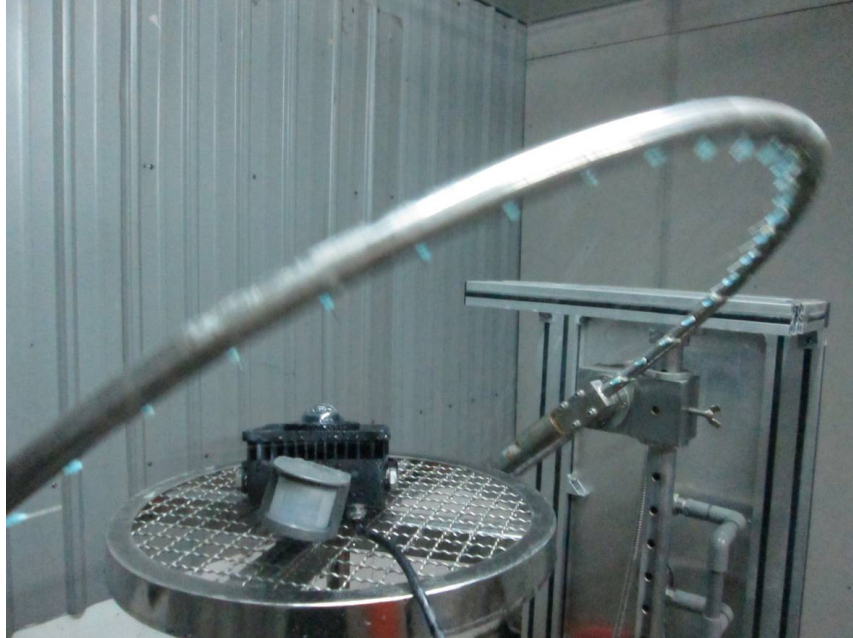
IPX4 after the test