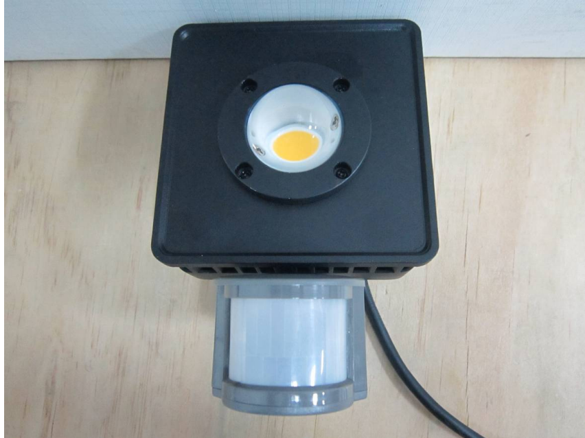
The appearance of photo