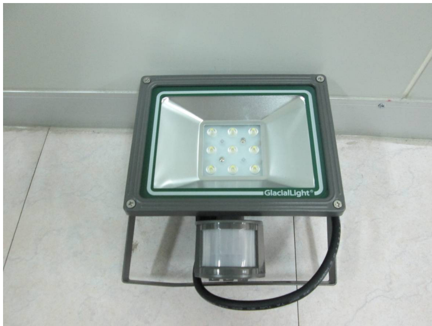
Before the test