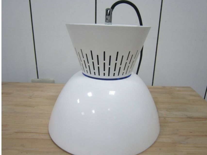
The appearance of photo