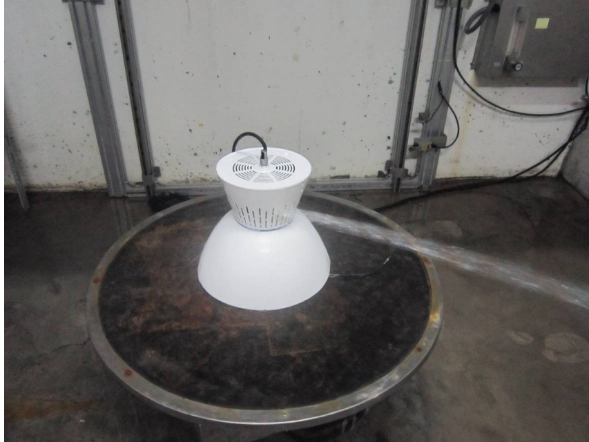
IPX5 after the test