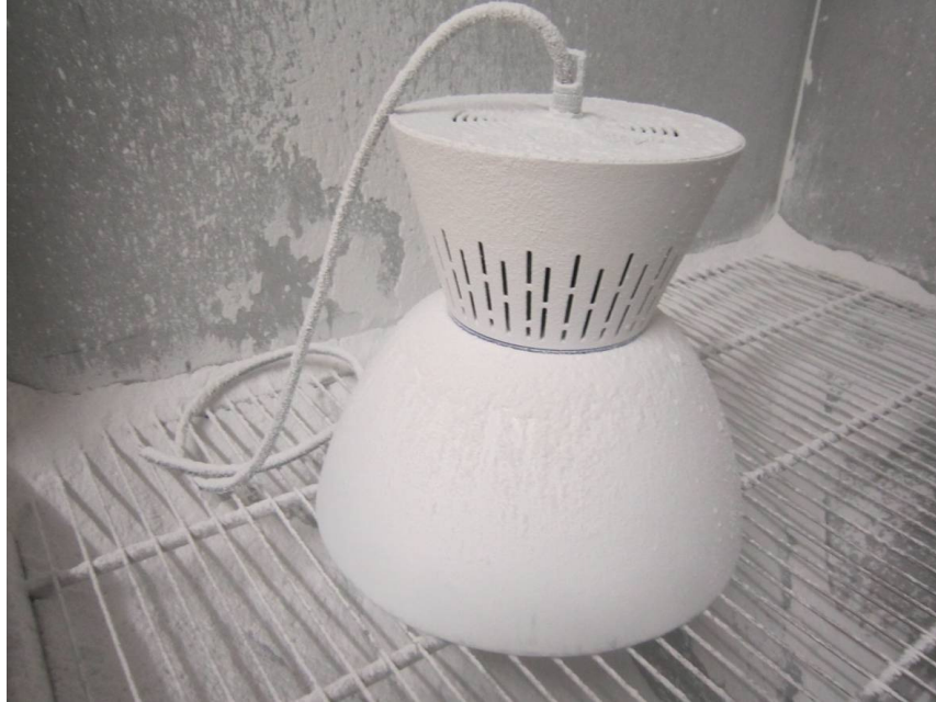
IP6X after the test