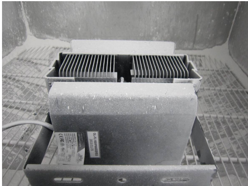
IP6X after the test