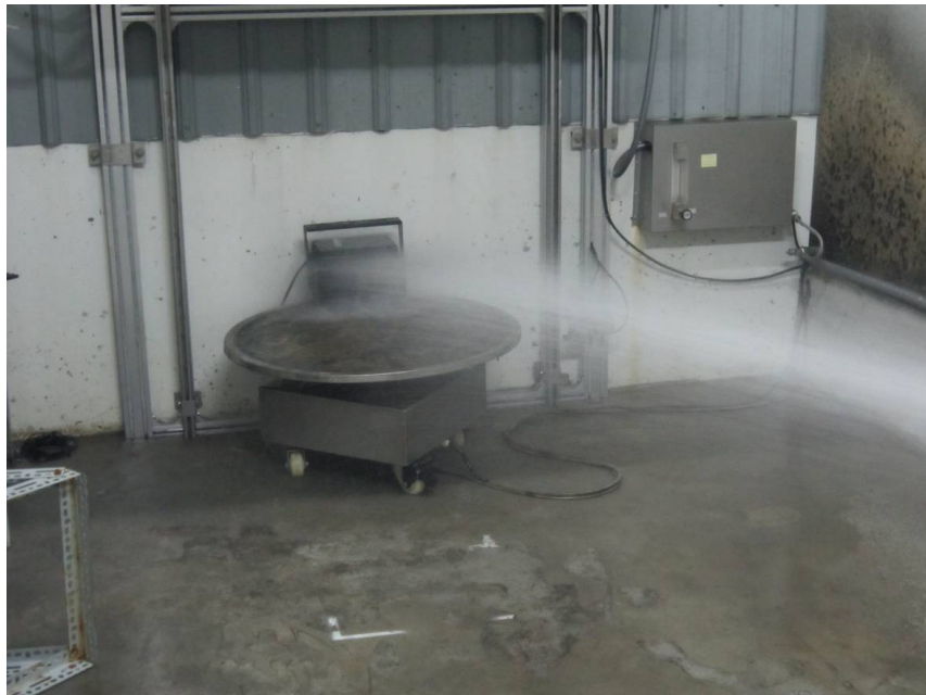
IPX6 after the test